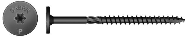
TABLE 3. 5/16" Diameter & 3/8" Diameter Ledger Structural Screws